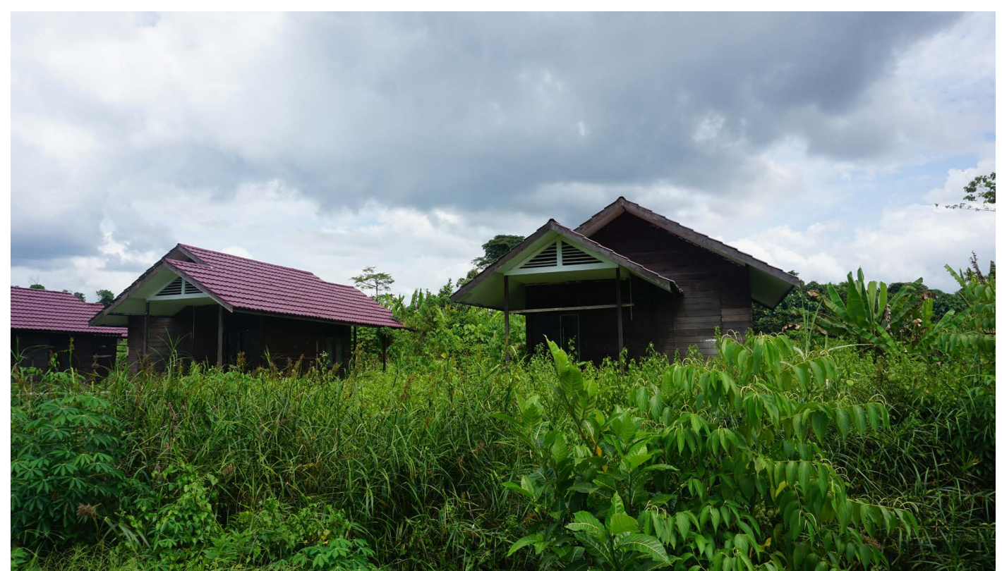
Kaltim Prima Coal built a resettlement site for villagers it seeks to displace. But few residents were able to make ends meet there. The resettlement site is now largely abandoned.