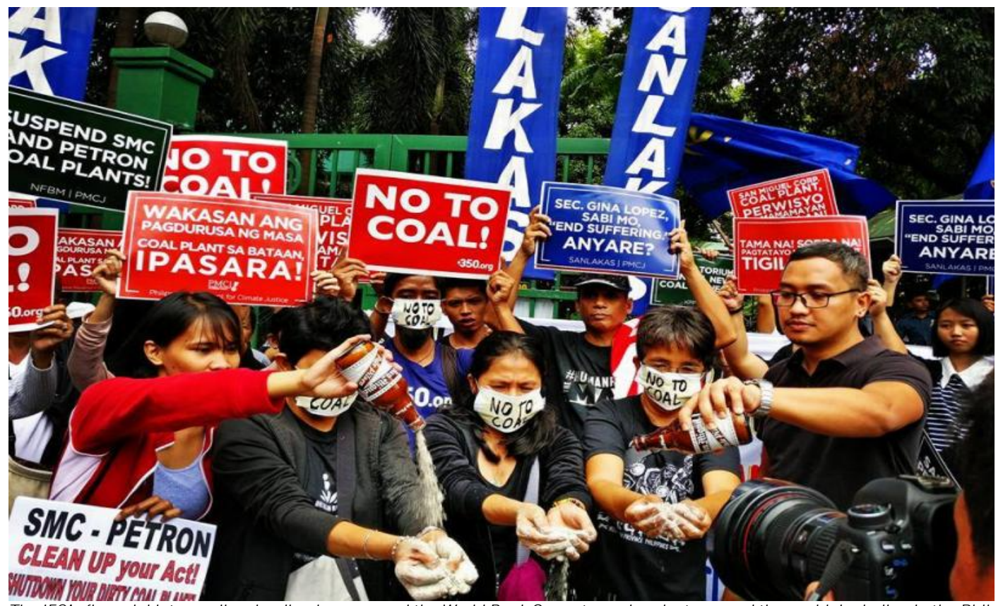
The IFC's financial intermediary lending has exposed the World Bank Group to coal projects around the world, including in the Philippines, where public opposition to new coal plants is strong.

financial-sector portfolio are systemic and run deep. A few years ago, the issue was not fully understood by the public, which knew of only a handful of cases in which IFC was exposed to companies that were causing harm to people or the environment through financial intermediaries.