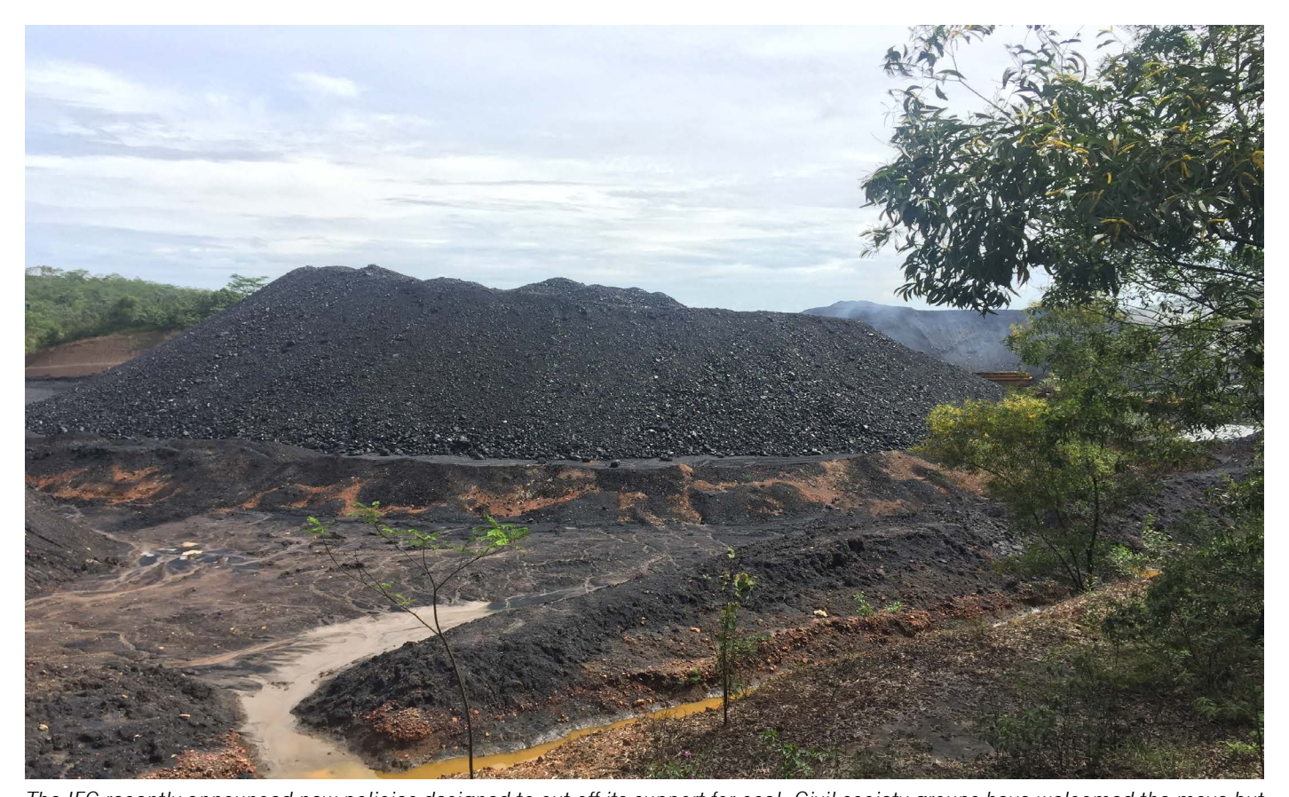
The IFC recently announced new policies designed to cut off its support for coal. Civil society groups have welcomed the move but say the policies are only as effective as their implementation.

If Indonesia illustrates the extent of the IFC's coal problem, it also offers an opportunity to