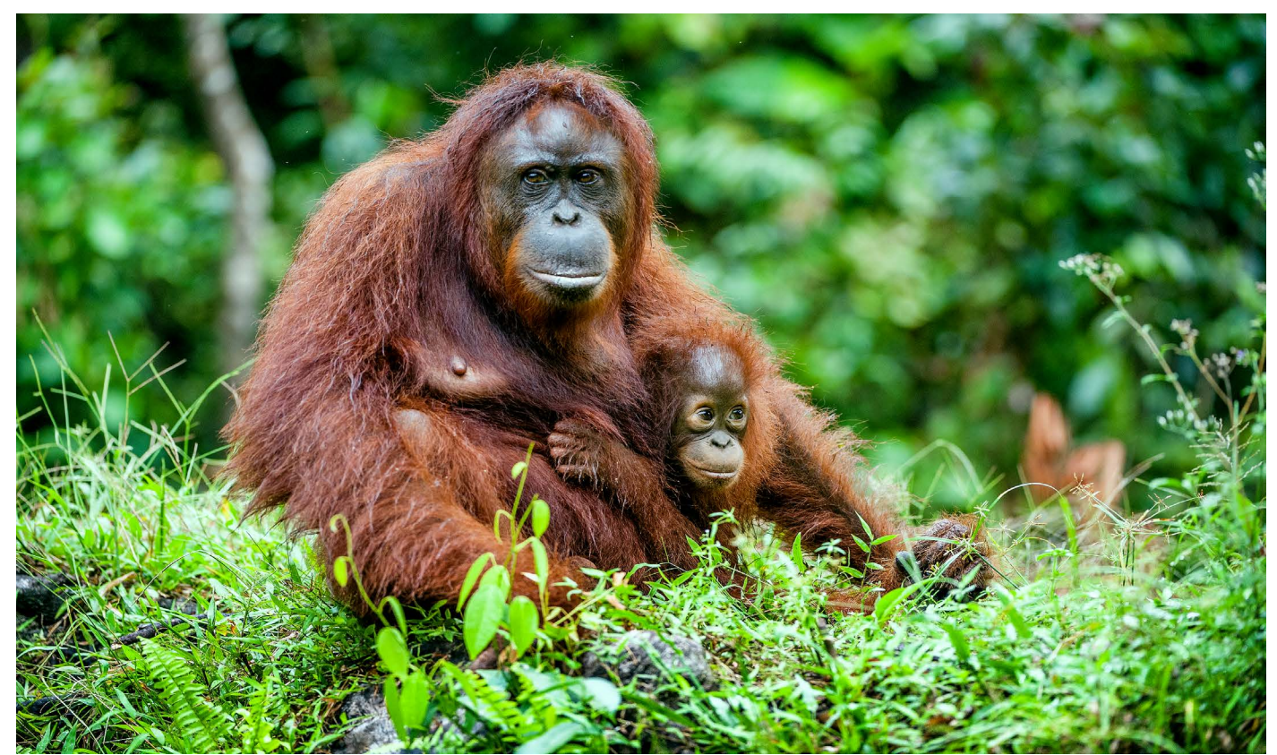
Coal mining threatens Indonesian Borneo's globally important biodiversity, including its endangered population of orangutans.

<u>emitter</u>, ahead of Brazil, according to European Commission data.